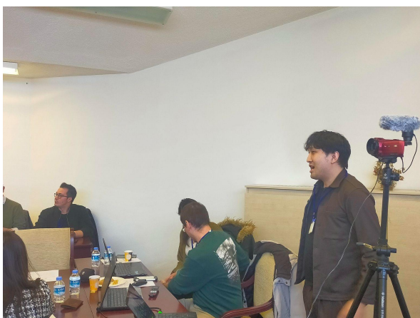
Presentation by student