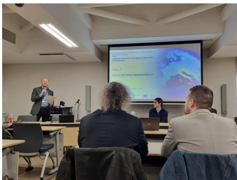
Poster session and panel discussion